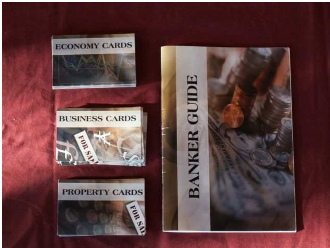
BANKER'S GUIDE & CARDS